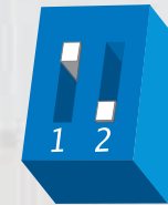
ABS on (default)

When ABS is activated, the dwell is increased after 15 seconds of non-use for the next shot fired. This helps to prevent bolt-stick, but may result in higher velocity for the first shot.